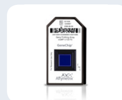
Gene Profiling Array cGMP U133 P2 (RUO)

“The need for an FDA-cleared microarray platform was an important consideration in choosing the Affymetrix GCS 3000Dx system for Pathwork’s two FDA-cleared Tissue of Origin (TOO) tests, one that uses FFPE and the other frozen tumor samples. The Pathwork-Affymetrix PbA partnership continues to create value for both parties. ”