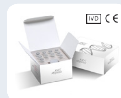
FDA-cleared, CE-marked Gene Profiling Reagents